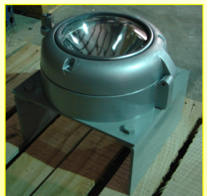
Ditch Light Kit

The extended visibility of the New Vision Ditch Lights provide dramatically increased response time for locomotive operators and allows them time see track defects more readily.