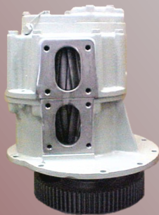
3 Stage Scavenging Pump #8296459