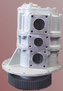
4 Stage Scavenging Pump #40000226