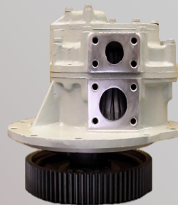
2 Stage Pressure Pump #8122949